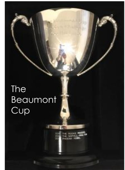
The Beaumont Cup